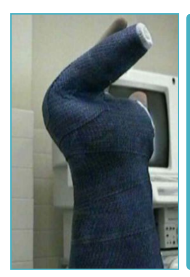
Figure 3 - An example of a cast worn after a boxer's fracture