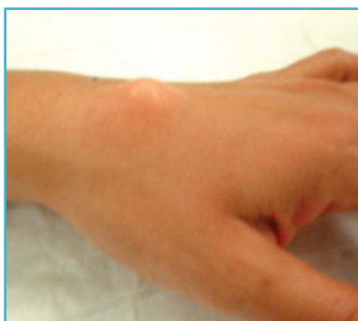
Figure 1: A ganglion on the top side of the wrist

Ganglion cysts are lumps around the hand and wrist that occur adjacent to joints or tendons. Ganglion cysts are very common. They are most frequently found on back of the wrist (see Figure 1), the palm side of the wrist, the base of the finger on the palm side, and the top of the end joint of the finger (see Figure 2). Ganglion cysts are filled with a clear, gel-like fluid and often resemble a water balloon on a stalk (see Figure 3). These cysts may fluctuate in size, and some may eventually disappear completely. Ganglion cysts are not cancerous and will not spread to other areas.