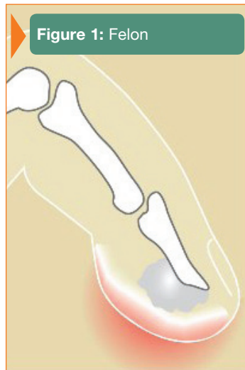
Figure 1: Felon

MRSA, or Methicillin Resistant Staphylococcus Aureus , is a bacterium resistant to usual antibiotics used to treat infections. In the past, MRSA was seen in those in a hospital or nursing home. However, MRSA also can come from community places like gyms, dorms, houses, and daycares. Skin infections usually look like boils or collections of pus. Sometimes surgery is needed to drain the infection. If you start taking an antibiotic for something that looks like this and it is not getting better over two days, contact your health care provider. It is important that skin MRSA is treated right away to prevent it from causing more serious infections. Also, talk to your doctor about what to do to prevent spread to others.