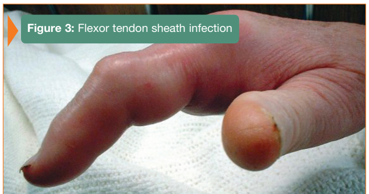
Figure 3: Flexor tendon sheath infection