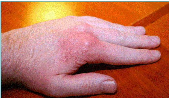
Figure 1: Acute gout episode with a swollen, red and painful finger

Pseudogout is a type of inflammatory arthritis that causes joint inflammation due to the body depositing calcium pyrophosphate crystals in the joint and soft tissues. Pseudogout is also called calcium pyrophosphate deposition disease (CPPD). Gout is a more commonly known, similar type of inflammatory arthritis. Although in gout, monosodium urate crystals are deposited in the joint and soft tissues. In each of these conditions, the crystals and the body's reaction to them within the joint can lead to joint damage. Inflammatory arthritis is different from degenerative arthritis, which includes conditions such as osteoarthritis. In pseudogout, patients will experience symptoms similar to gout arthritis with episodes of swelling, pain and redness of joints (Figure 1).