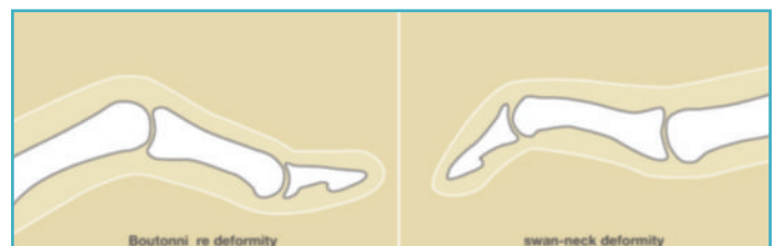
Figure 3: Boutonnière and swan-neck finger deformities