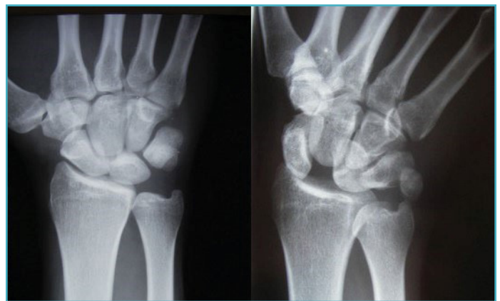
Figure 2 - X-ray showing a gap between the scaphoid and the lunate (left) and a normal x-ray (right)

A diagnosis of scapholunate instability may be difficult to make. Your doctor will examine your wrist to see where it hurts and to check how it moves. X-rays are often used to help understand your wrist pain. Your surgeon may compare the injured wrist with the uninjured wrist. When the ligament is torn, it no longer holds two carpal bones (the scaphoid and the lunate) together, allowing a gap to form between them (Figure 2), and the bones move separately from one another. MRI can also aid in diagnosis of these injuries. If left untreated, ligament tears typically lead to arthritis over time.