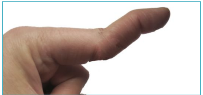
Figure 2: A Swan Neck deformity